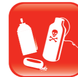
HOUSEHOLD PRODUCTS & PESTICIDES