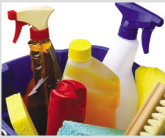
WHEN CHILDREN GET INTO HOUSEHOLD PRODUCTS, POISON CENTER EXPERTS ARE JUST ONE CALL AWAY.