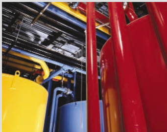
POISON CENTERS GIVE ADVICE ABOUT PREVENTING AND TREATING CHEMICAL EXPOSURES ON THE JOB.