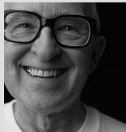
POISON CENTERS HELP SENIORS AND PEOPLE OF ALL AGES WHEN THEY TAKE TOO MUCH OR THE WRONG MEDICINE.